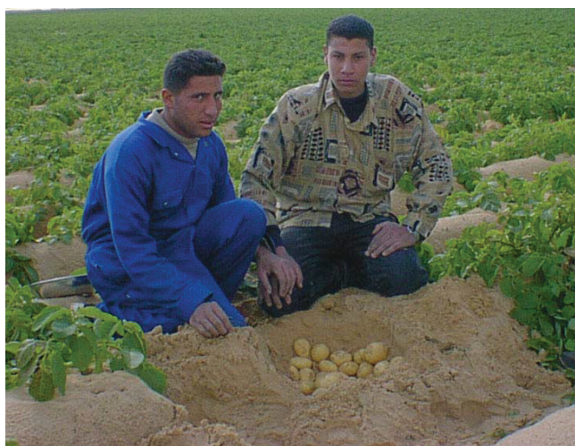
Collecting Yield Data from One of the Potato Test Plots