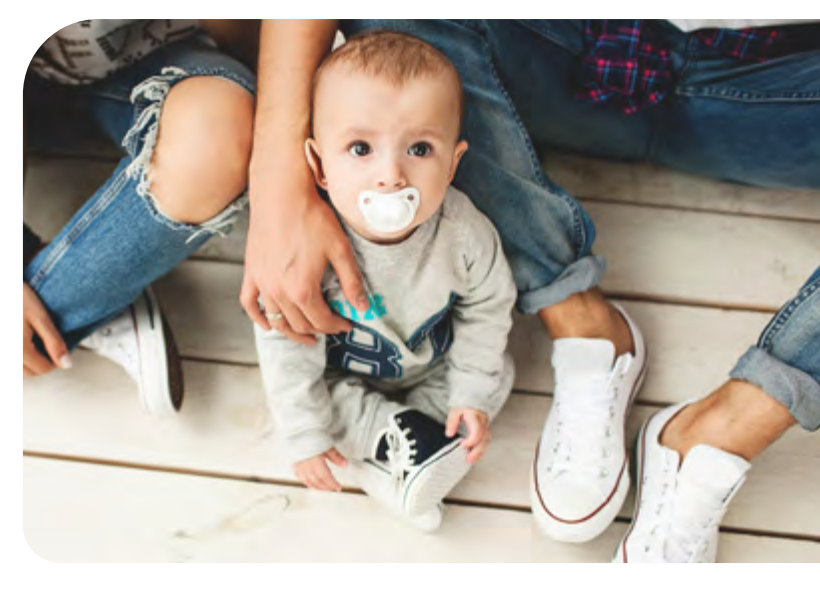
This work will be presented at the <u>Nutritional</u> <u>Immunology Across the Lifespan Conference</u>, sponsored by FASEB, from Jul 30-Aug 3, 2023. Balchem is a Gold Sponsor for the event.

Since choline plays a role in a process called methylation – an important molecular tool by which your body controls growth and development – the team looked at whether a specific methylation mark in the fetal brain was impacted (Trimethylated Histone H2 Lysine 27 - or H3K27me3). Their work found that low choline decreases the level of this methylation marker in the developing brain, triggering a series of detailed events which ultimately lead to disrupted brain development.